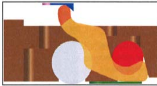
Fig. 1. Pad ROL™100A Series