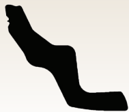
Gold-Plated Contact Profile