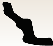
Low-Force XL-2 Contact Profile