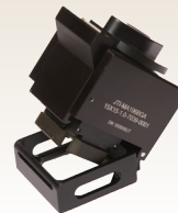
ZMA Z-Axis Manual Actuator