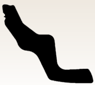
Gold-Plated Contact Profile Matte Tin Configuration