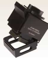
DL-VCMA Plus™ Double-Latch Vertically Compliant Manual Actuator